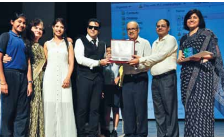
Sri Govinda, Actor, Promotional event at The Heritage School